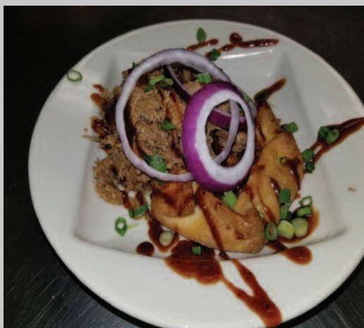
Pork Apple Galette