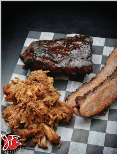
Meat Lover's Platter