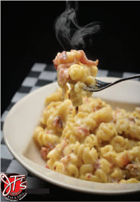
Smoked Gouda Mac & Cheese